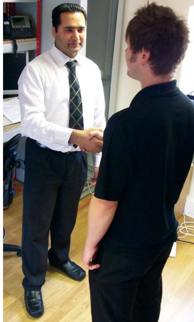
Engineer at customer site