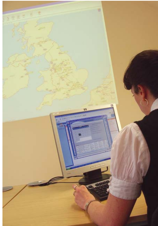
Trustco Service Desk