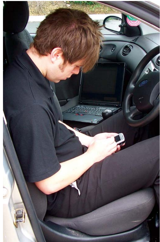
Engineer remotely connecting into the secure portal

Engineers also have the ability to remotely update calls and even resolve them; by connecting to a secure portal. The secure portal will automatically update the Trustco Service Desk records, ensuring high levels of productivity.